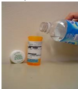
Mix with water and coffee grinds, cat litter, or dirt