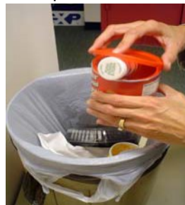
Place in opaque container