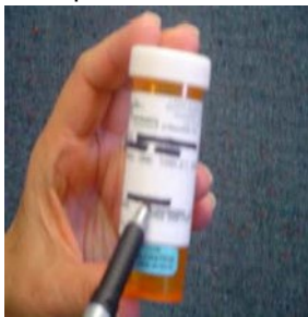
Mark out personal information