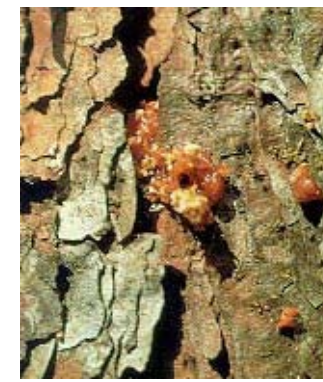
Ips pitch tube

Southern pine beetle galleries are curved or S-shaped and are normally packed with a brown frass and boring dust produced by the beetles. Black turpentine beetle galleries are D- or fan-shaped galleries. Ips egg galleries are roughly Y- or H-shaped and radiate out from a central cambium.