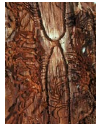
Ips galleries.