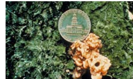
Black Turpentine pitch tube.