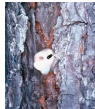
Southern Pine pitch tube.