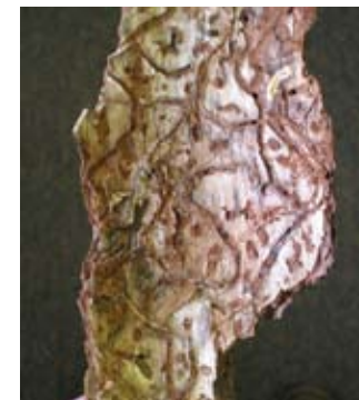
SPB galleries.