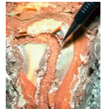
BTB galleries.